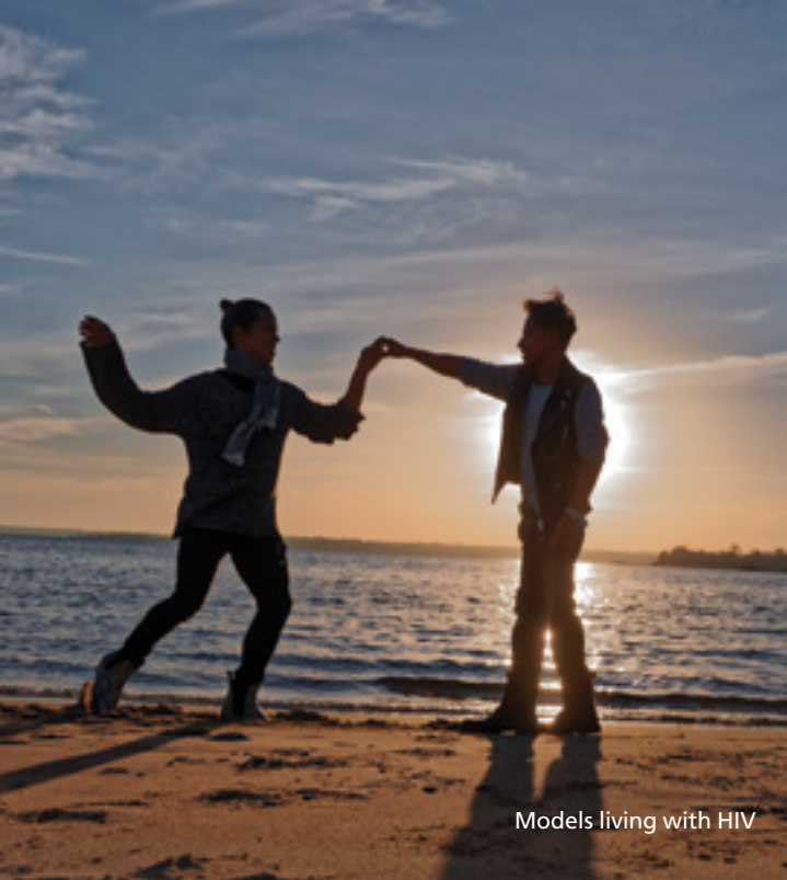
Models living with HIV