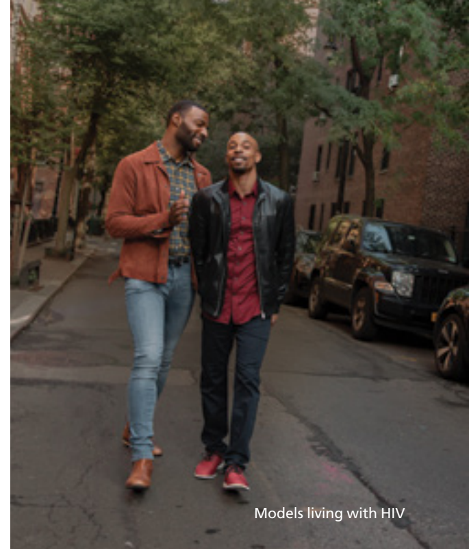
Models living with HIV

TAKE A PIC OF THESE QUESTIONS AND DISCUSS THEM WITH YOUR HEALTHCARE PROVIDER.